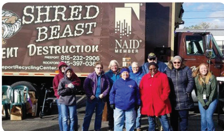
Free Community Shred Day