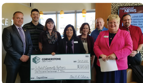
Donations to 3 local organizations at S. Beloit Ribbon Cutting