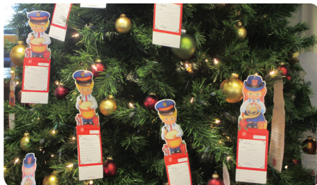
Salvation Army Angel Tree

Cornerstone Credit Union is committed to supporting and participating in local charitable and community events throughout the year. Here are a few examples from 4th quarter 2018. Visit our community outreach website page to see the full story!