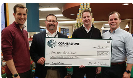
WREX-TV Freeport Food Drive